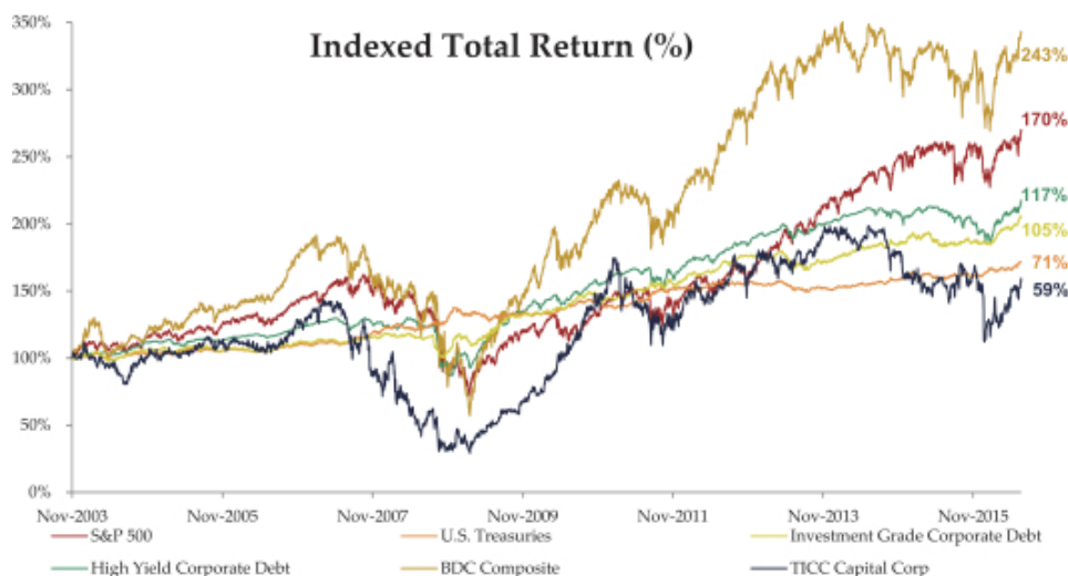
Poor Stewardship has Resulted in Drastic Long-Term Underperformance

It is unacceptable that, in a historically low interest rate environment, a Stockholder would have generated higher returns by investing in U.S. Treasuries than by holding TICC stock.