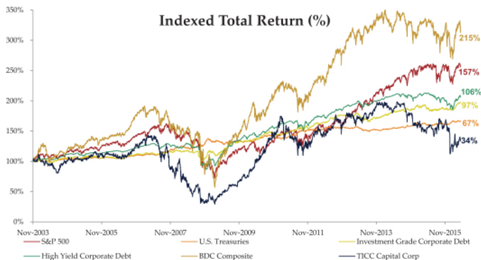
Poor Stewardship has Resulted in Drastic Long-Term Underperformance 4

It is unacceptable that, in a historically low interest rate environment, a Stockholder would have generated higher returns by investing in U.S. Treasuries than by holding TICC stock.