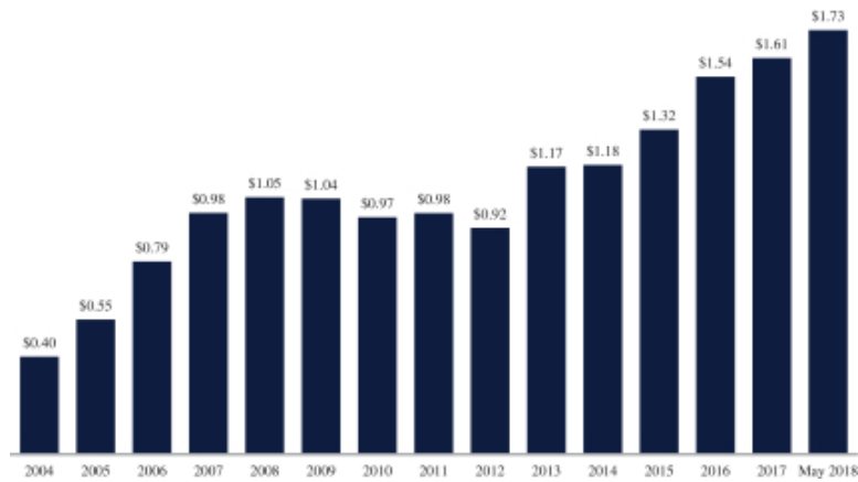
($ in trillions) Source: Preqin Ltd., as of May 2018

The graph below illustrates the increase in the uninvested capital held by private equity funds that is available to be invested.