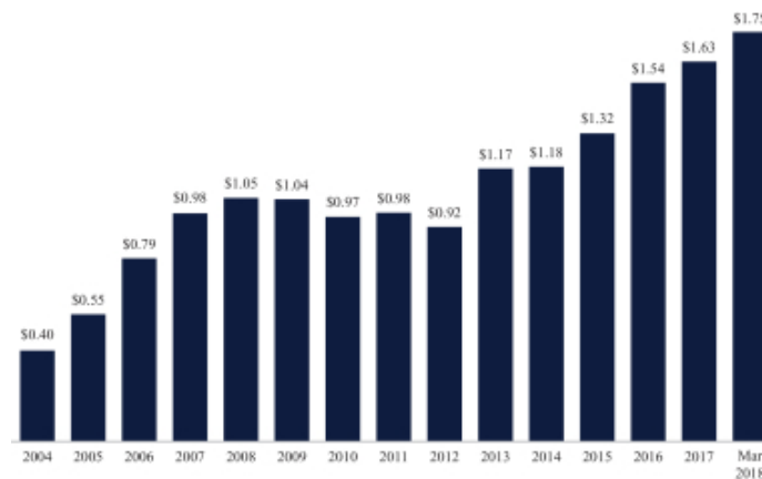
($ in trillions)

The graph below illustrates the increase in the uninvested capital held by private equity funds that is available to be invested.